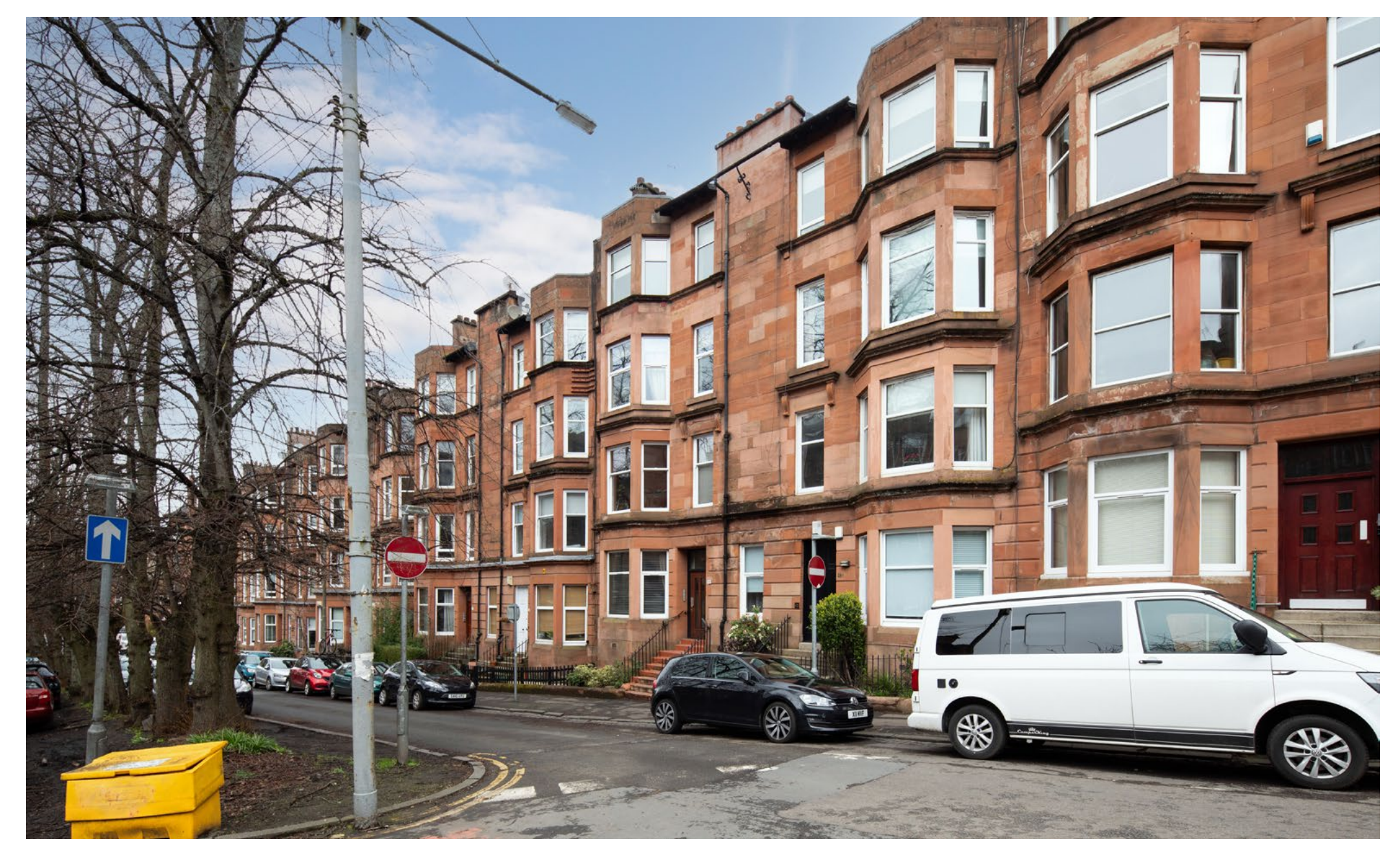
Flat 3/1, 45 Edgemont Street, Shawlands