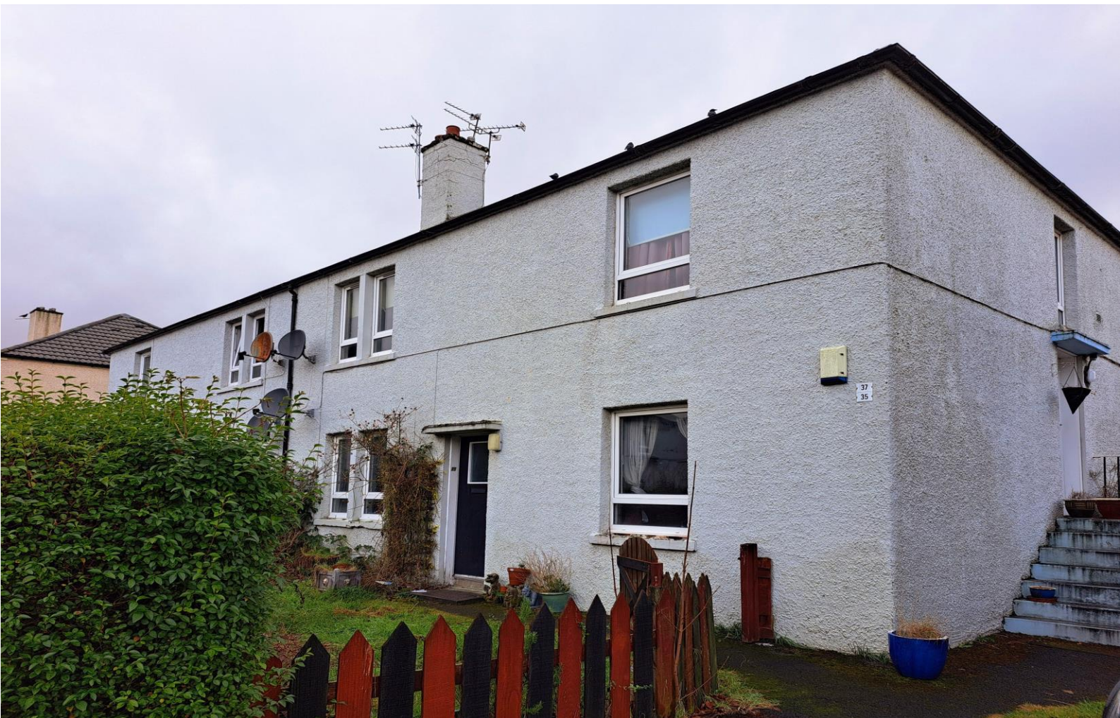
OFFERS OVER £87,000

Well maintained ground floor flat situated within the town of Alloa.