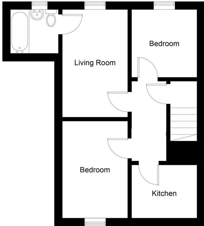
Illustration for identification purposes only, measurements are approximate, not to scale. floorplansUsketch.com © (ID1049931)