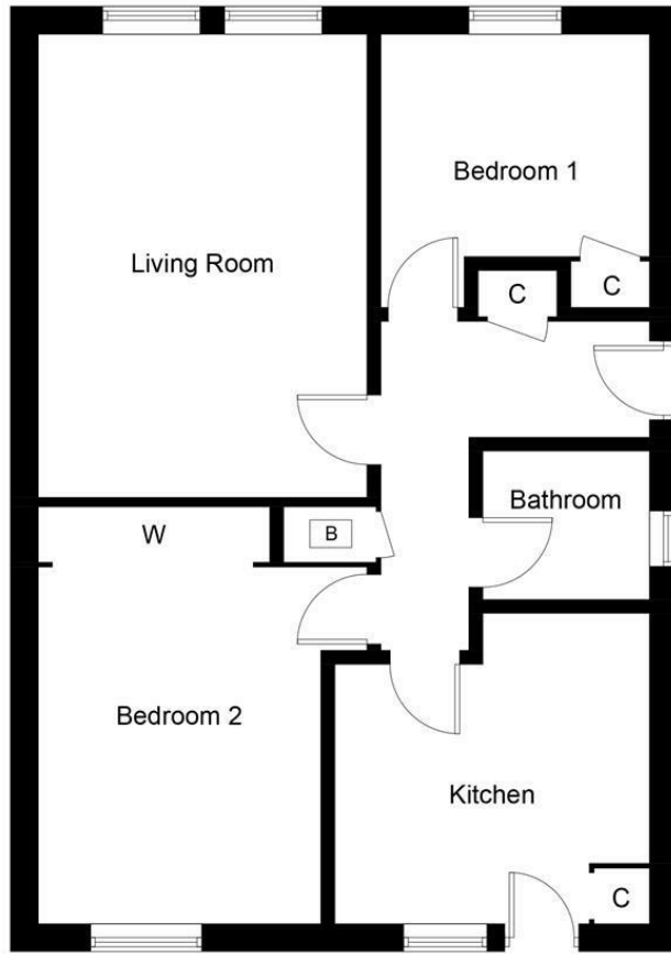
Illustration for identification purposes only, measurements are approximate, not to scale. (ID1061402)