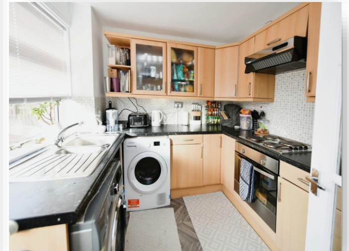
Hazelgrove, Kilwinning KA13 7JH