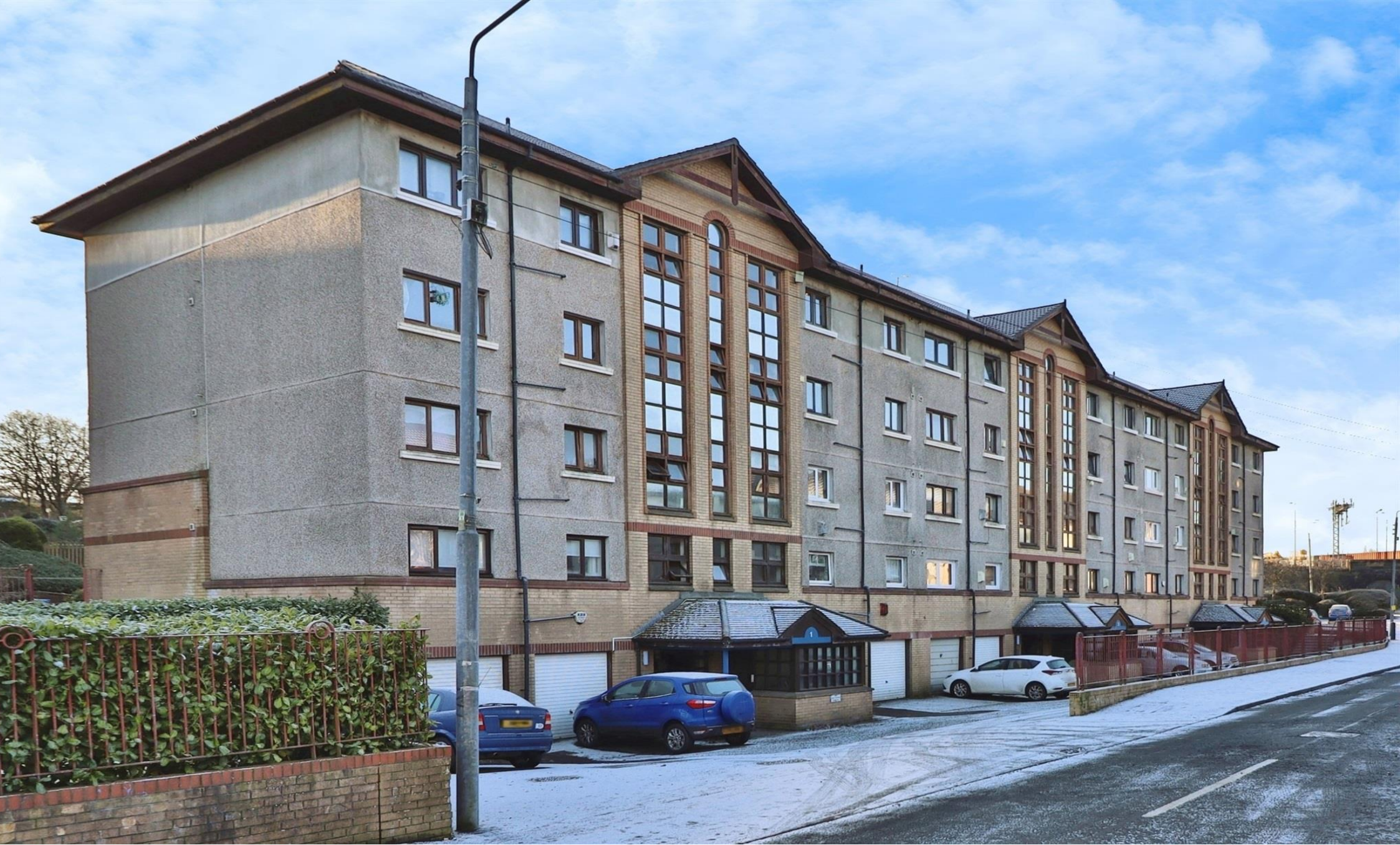
Elmvale Row, Glasgow G21 1ND