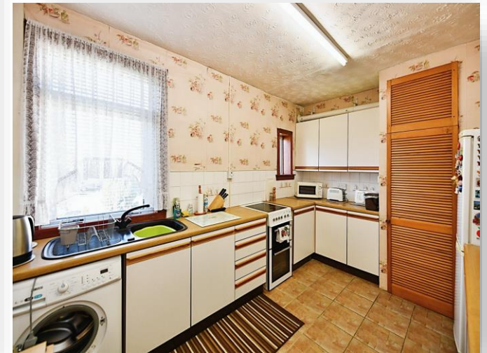
Alexandra Terrace, KILWINNING KA13 7HQ