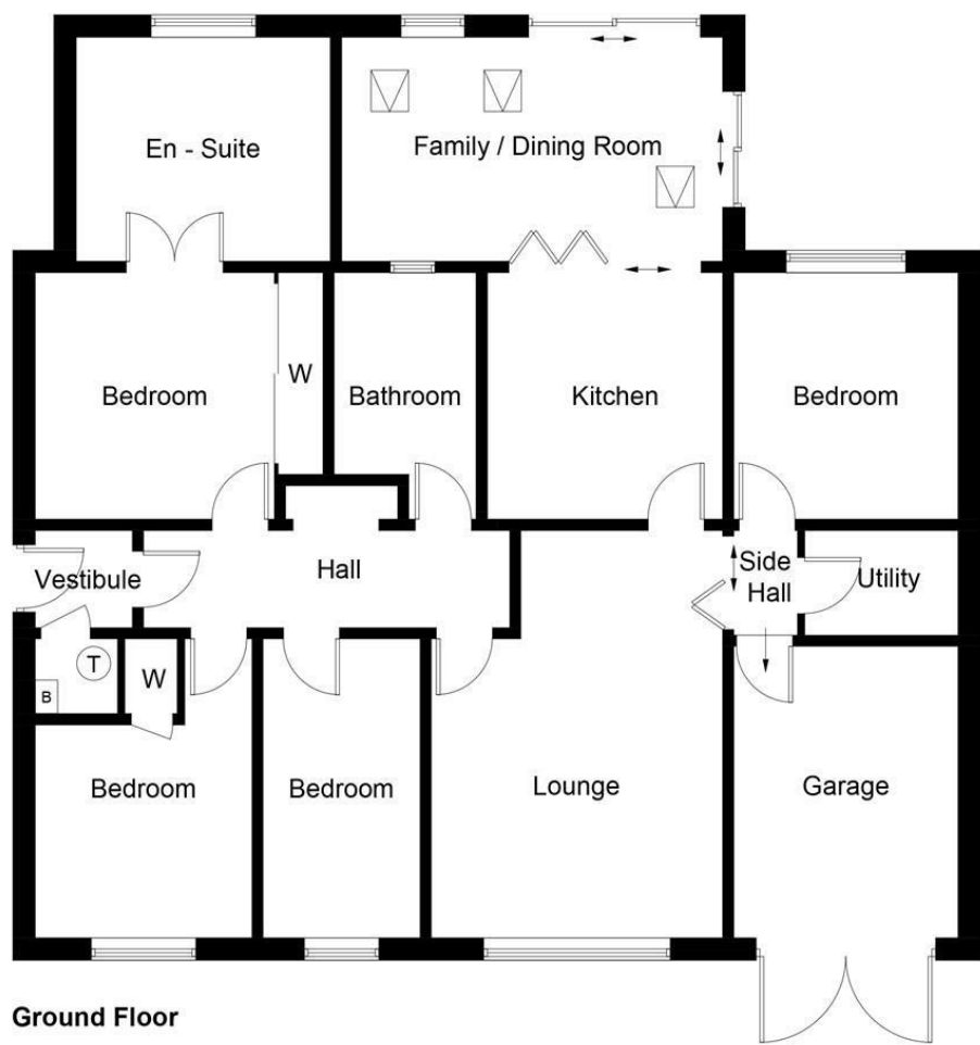
Illustration for identification purposes only, measurements are approximate, not to scale. floorplansUsketch.com © (ID614485)